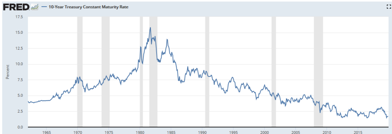
Illustration I: 10-year Treasury historical yield chart